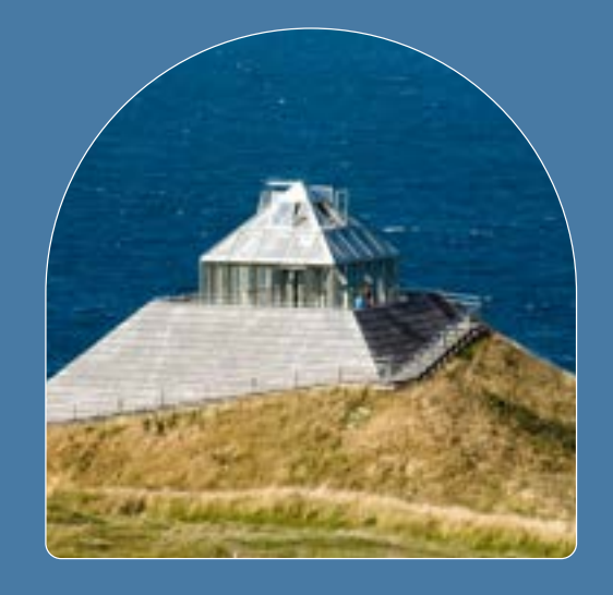
The Ceide Coast