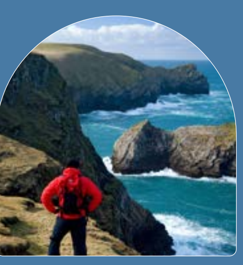
Wild Atlantic Way